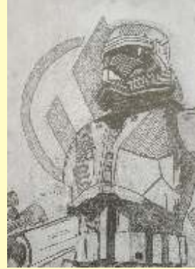
Karthik 10 A