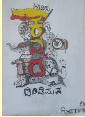
Amith R, 10 A