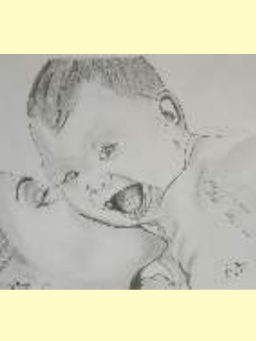
Sevitha 10 A