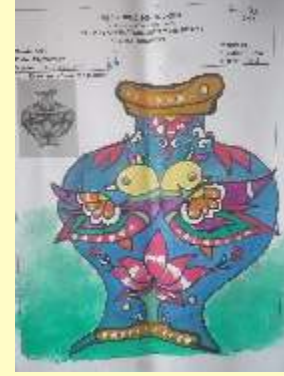
Ananya 7 A